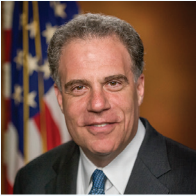
Michael E. Horowitz Chair