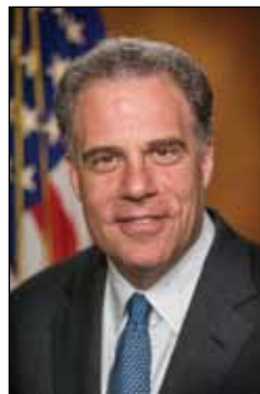
MICHAEL E. HOROWITZ Chairperson

Most especially, we express our sincere thanks to the approximately 13,000 professionals who make up the Federal IG community, whose tireless efforts on behalf of the public they serve continue to improve the economy, efficiency, and effectiveness of the Federal Government.