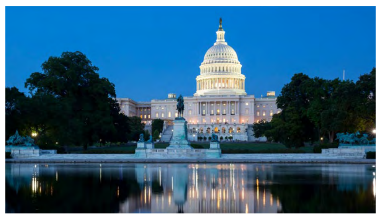
West Front of the U.S. Capitol Building, Washington, D.C.

The Council of the Inspectors General on Integrity and Efficiency (CIGIE), to which all 75 IGs belong, provides training for OIG employees; develops policies, professional standards, best practices, and common approaches for the work of the OIGs; and coordinates reviews by OIGs on issues that span multiple agencies. In addition, through its Integrity Committee, CIGIE receives, reviews, and refers for investigation allegations of wrongdoing made against IGs, designated staff members of those IGs, and the Special Counsel and Deputy Special Counsel of the Office of Special Counsel (OSC).