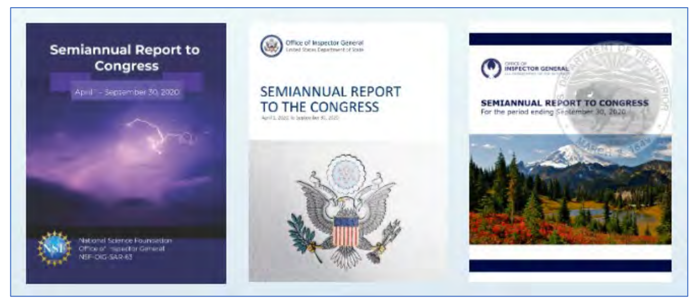
Agency IGs must issue Semiannual Reports to Congress detailing significant problems and deficiencies during the preceding 6-month period.

In addition to the Semiannual Report to Congress, IGs have other mandatory reporting requirements, such as annual audits of agency financial statements, annual evaluations of information security programs and practices, annual discussion of the top management challenges in their agencies, and annual reports on agency improper payments. A list of some significant recurring mandatory reporting requirements is contained in the Appendix.