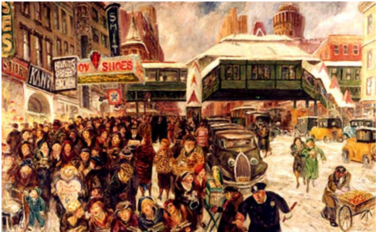
FOURTEENTH STREET AT SIXTH AVENUE