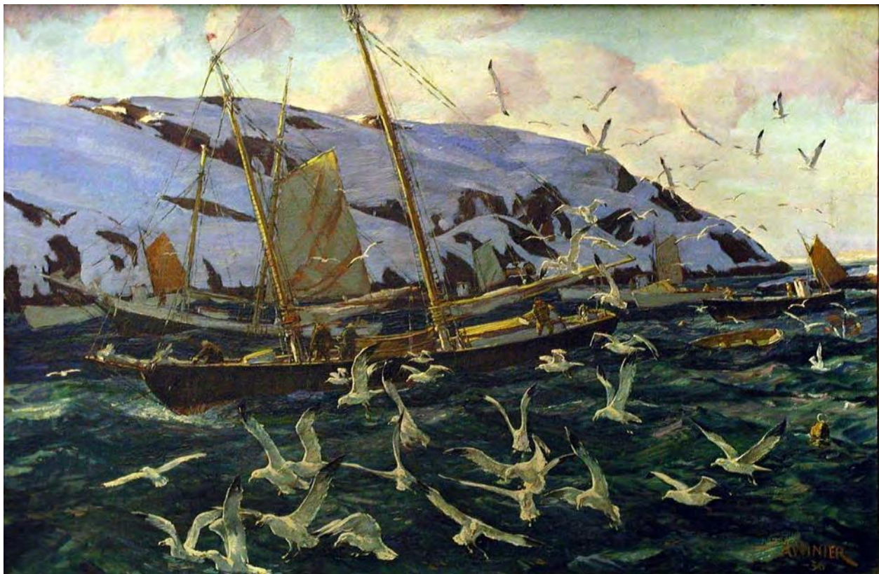
GULLS AT MONHEGAN

Andrew Winter’s “Gulls at Monhegan” was recovered after the United States filed a writ of replevin. A rela-